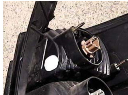
Location for the BX8869. (Photo of driver's side tail light assembly.)