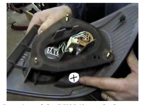
Location of the BX8869, on the bottom of the driver's side tail light assembly.

8. Using baseplate as a template, drill two holes into bottom of frame with the 13/32" drill bit, both sides. Insert nut plates into drilled 1 1/4" holes (drilled in step 5). Then align with drilled holes. Install bolts and lock washers into nut plate, tighten 2 bolts, both sides. Be sure and use loctite on all bolts before tightening. Tighten all bolts according to Torque Chart in the General Instruction Sheet.